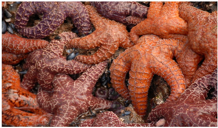
© Woolhalla, updated 2016 www.woolhalla.com This pattern tutorial is not to be sold; items made from it may be sold.